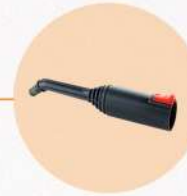
Water tank key