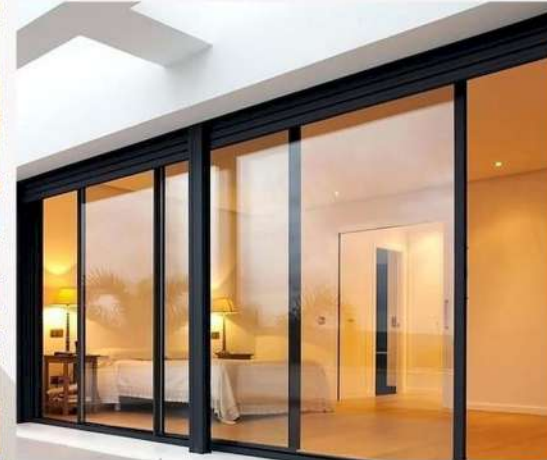
GLASS DOORS & HANDLES